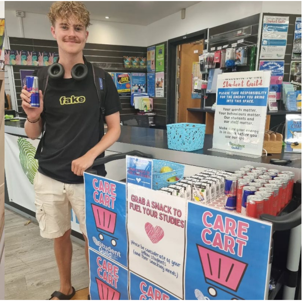
STUDENT GUILD - THE CARE CART