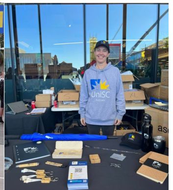
ORIENTATION PROGRAM AND ACTIVITES