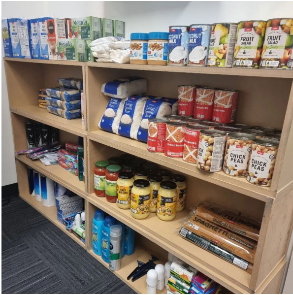
CABOOLTURE - EMERGENCY FOOD BANK