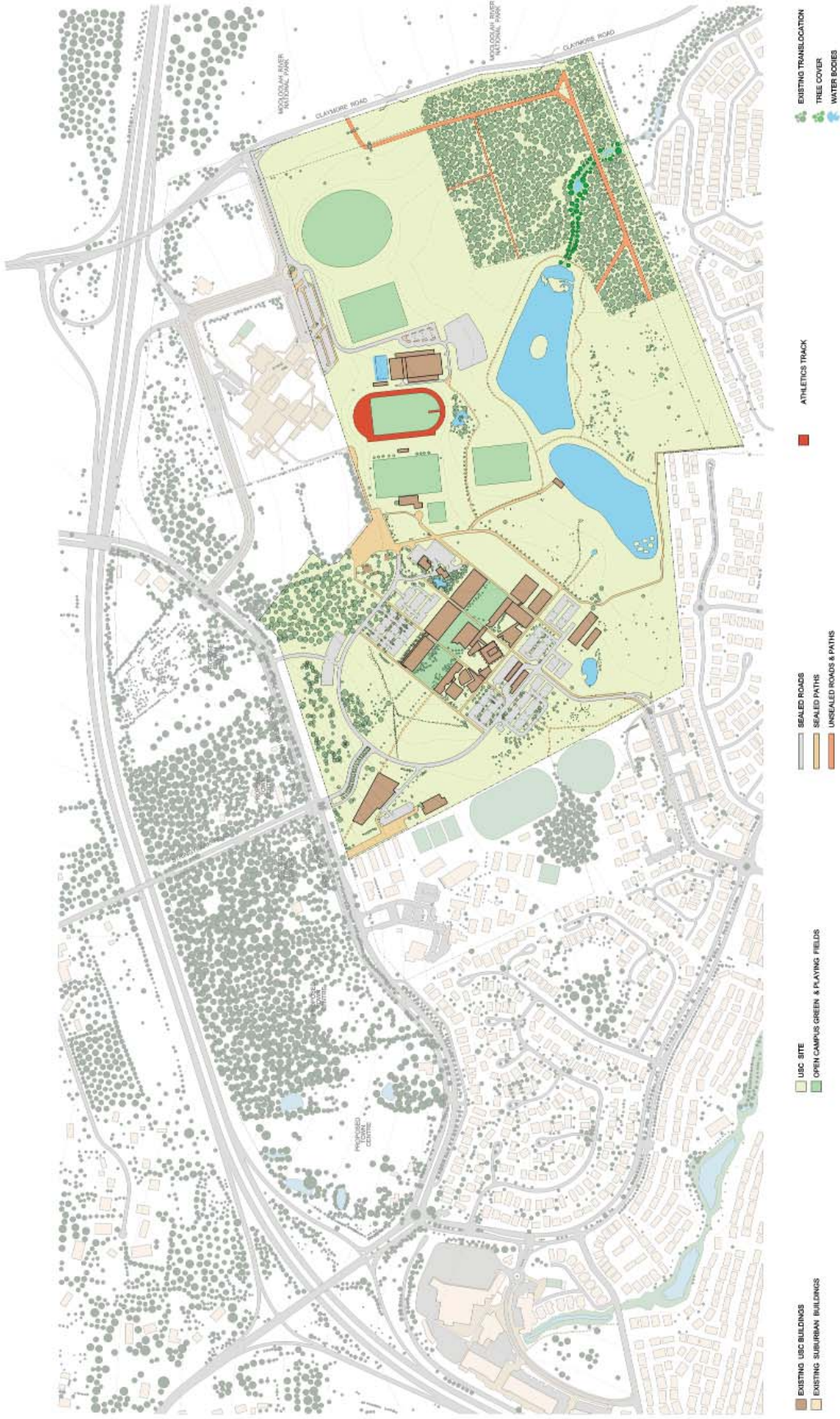
Diagram | 3.4.1