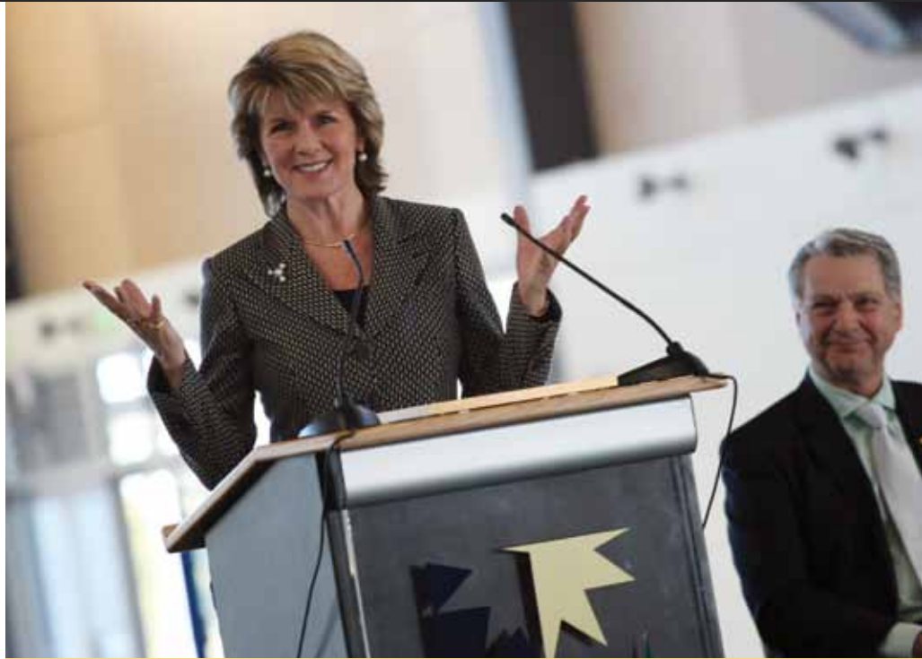
Federal Education, Science and Training Minister Julie Bishop congratulates USC on its new stadium.

Construction of the stadium received $5 million from the Federal Government's Voluntary Student Unionism Transition Fund