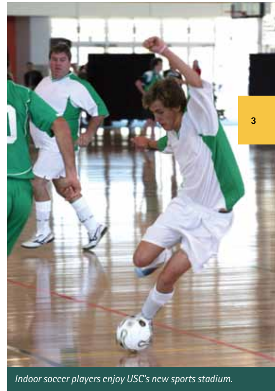
Indoor soccer players enjoy USC's new sports stadium.

The Federal Government recently pledged $3.5 million, to be provided over the next two years, giving the project a major boost.