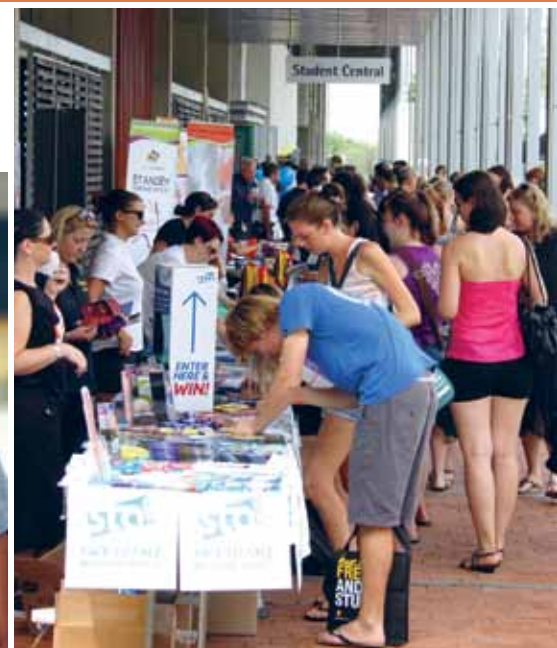
Students check some of the information stands outside Student Central.