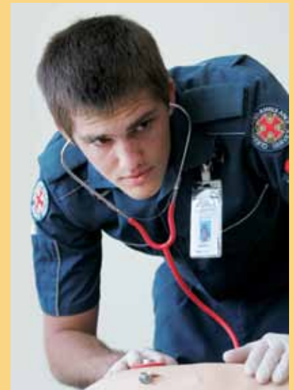
Paramedic Science has become one of USC's most popular degrees.