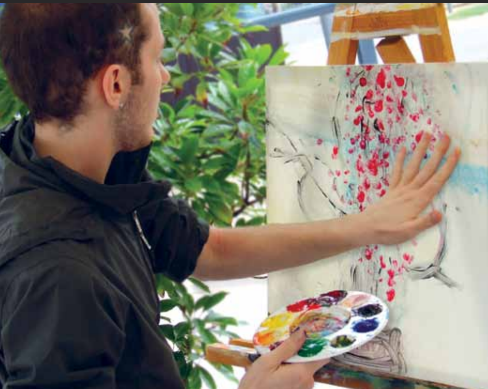
USC Gallery's "So you think you can paint" competition could become a regular Orientation activity.