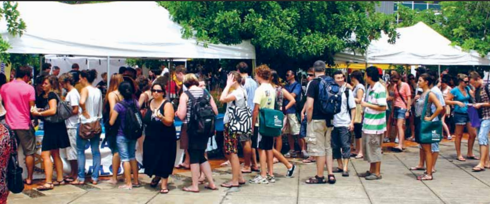
The barbecue lunches throughout O-Week attracted large crowds.