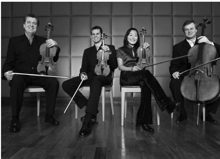
Proceeds from the Australian String Quartet's Take Flight concert went toward supporting the University Art gallery.

In early November, an International Peer Review Team, appointed by the OECD, visited the region. They met with key stakeholders, including students on both campuses, to test the contents of the Self Evaluation Report. Preliminary feedback from the OECD is highly complimentary of the way the University is undertaking an 'engaged' process in preparing the Self Evaluation Report. The final report will be placed on the OECD's website for international scrutiny.