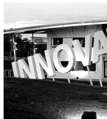
The aim of the Innovation Centre is to create jobs in knowledge-based businesses in the Knowledge Precinct developing around the University.