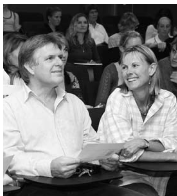
Proving extremely popular, the number of people attending Keep PACE sessions expanded in 2005 to 579.