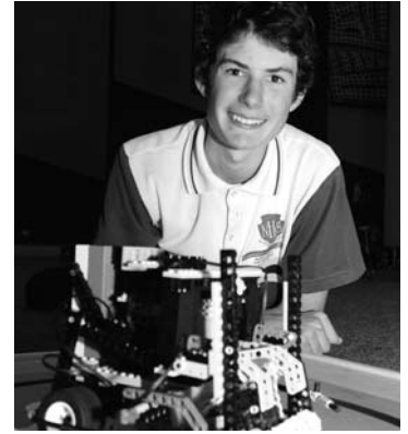
Local students welcomed the RoboCup challenge.