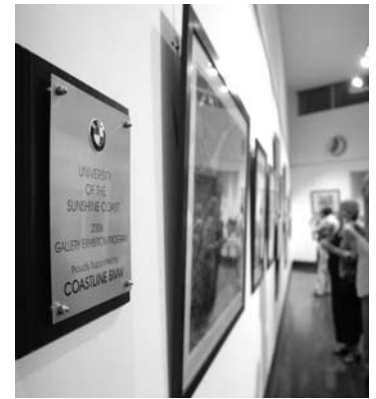
Ten exhibitions were hung in the University Gallery during 2005.